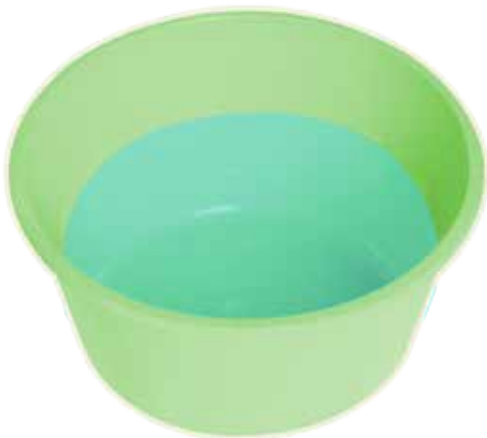
Bowl of lukewarm water