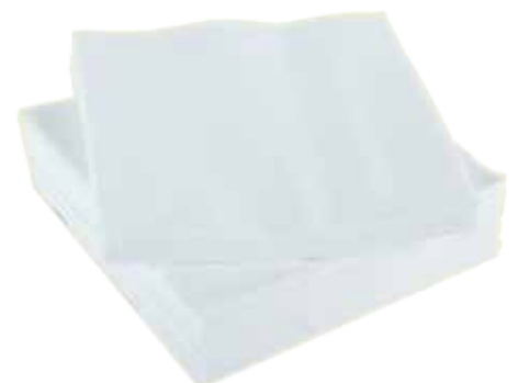
White napkins or kitchen roll