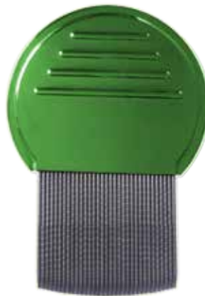
Head lice comb

You can buy a good head lice comb at the pharmacist's. This comb has very fine, angular teeth that are very close together and do not bend.