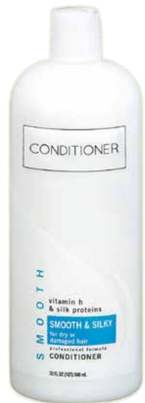
Cream rinse, conditioner or balsam solution

You can buy a good head lice comb at the pharmacist's. This comb has very fine, angular teeth that are very close together and do not bend.